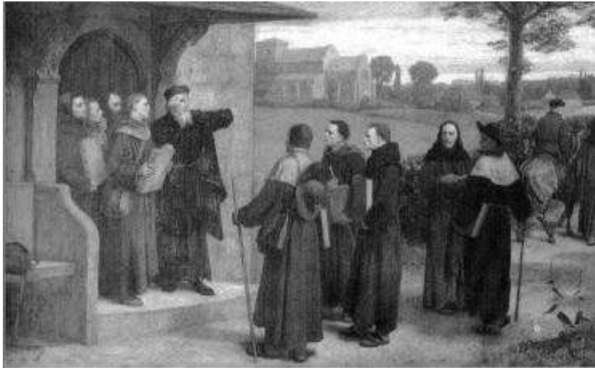
From Lutterworth, John Wycliffe mobilised the Lollards to evangelise England.

In the 14th Century, Oxford was the most outstanding university in the world, and John Wycliffe was its leading theologian and philosopher.