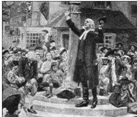
John Wesley preached over 40,000 sermons in the last 50 years of his life.

The Wesley brothers were central figures in the 18th century Evangelical Revival in Great Britain. Theirs was one of the most effective partnerships between brothers in ministry.