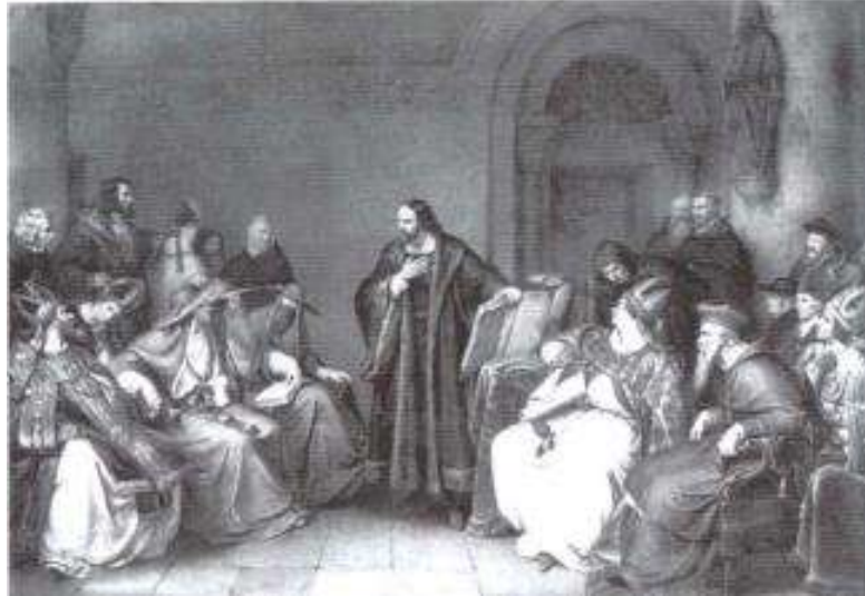
Professor John Hus proclaimed Reformation doctrines at the Chapel of Bethlehem and at the University of Prague.

The Reformation movement launched by Wycliffe and his Lollards in England was intensely opposed and fiercely persecuted by the Roman Church. The Reformation movement was largely driven underground in the British Isles. But Wycliffe's teachings spread to Bohemia where they resulted in a dynamic revival.