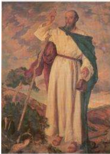
The Missionary who won Ireland to Christ.

Patrick was only 16 years old when he saw a fleet of 50 longboats heading for the shore. As the Roman Legions had long since departed Britain, Patrick’s home town was vulnerable to attack. As the Irish raiders leapt from their boats onto the pebbled beach, sounding their war-horns, the population fled in terror. The attackers looted and burned the village and carried away captives, including young Patrick.