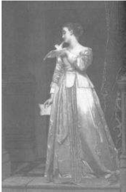
Anne Askew: "Attractive in form and faith."

Anne was born during the reign of King Henry VIII to an honoured knight, Sir William Askew.