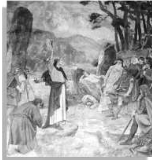
Columba preached, practised and lived missions. He instilled a love for poetry and for music in his converts.