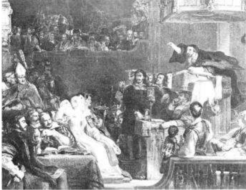
John Knox declared: “Dangerous times demand vigorous faith.” This picture is of John Knox preaching at St Andrews, 11 June 1559. On this occasion Knox was threatened that he would be shot in the pulpit.

As the books of Martin Luther and Tyndale’s translation of the New Testament entered Scotland, they were received with great interest. Students at St. Andrews University began to take their faith seriously. Patrick Hamilton, a student at St. Andrews, wrote a book that was condemned as heretical. He fled to Germany, met with Luther and soon returned to Scotland. Hamilton began preaching the Protestant Faith with great boldness.