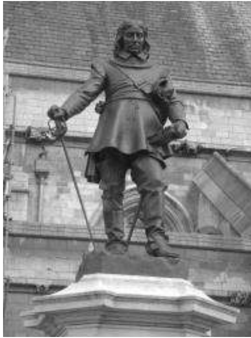
Oliver Cromwell, “ the chief of men ”, was a dedicated Puritan, relentless in battle, the Protector of Protestants, sponsor of foreign missions and champion of Religious Toleration.

Oliver Cromwell (1599-1658) was one of the greatest leaders ever to rule England. He was a dedicated Puritan, deeply and fervently devoted to carrying out the will of God. He was relentless in battle, brilliant in organization and had a genius for cavalry warfare. With a Psalm on his lips and a sword in his hand he led his Ironsides to victory after victory, first against the Royalists in England, then against the Catholics of Ireland, and finally against the rebellious Scots.