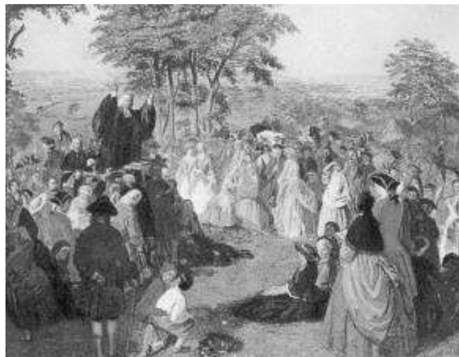
Whitefield electrified audiences throughout North America and the British Isles.