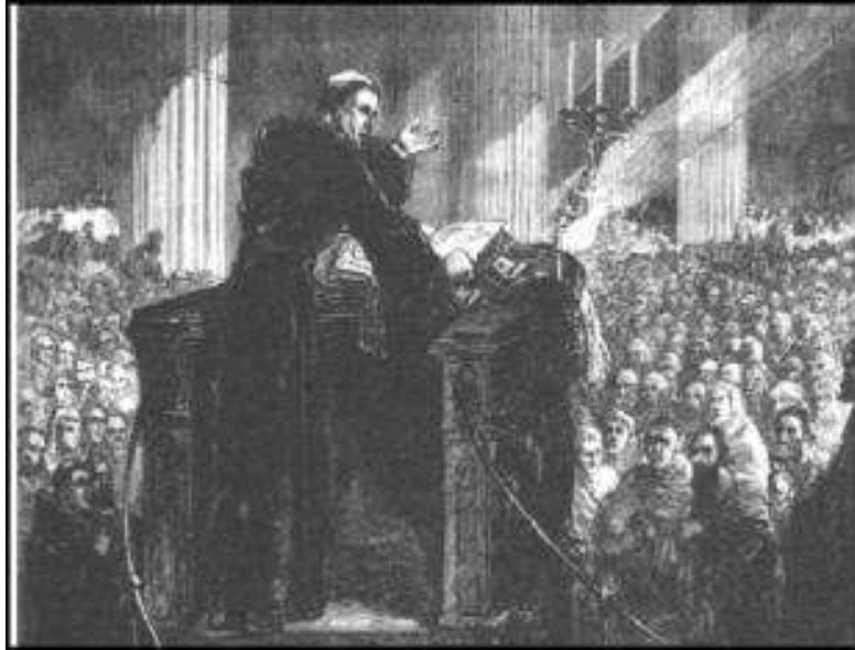
1 January 1519, Ulrich Zwingli began preaching through the New Testament, verse by verse, expositively, in Grossmünster, Zürich.

Ulrich Zwingli was the father of the Reformation in Switzerland. Born and raised in the Alps, Zwingli was one of the most colourful and audacious characters in Swiss history. A devout student of Scripture, Zwingli was transformed and shaped by the Word of God. He has been described as “an amazing combination of intellect, passion and wit.”