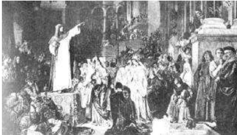
Girolamo Savonarola denounced the corruption and immorality under Roman Catholicism.