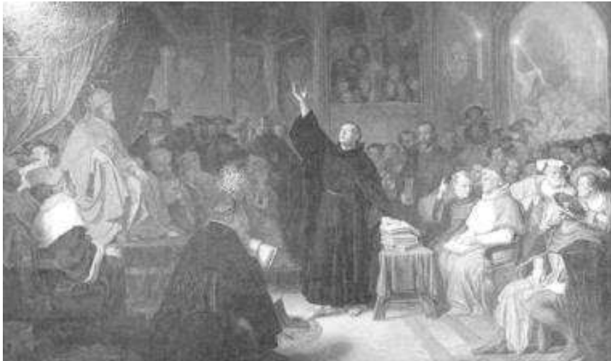
“My conscience is captive to the Word of God!”

The Reformation was one of the most momentous turning points in world history. It was led by men of strong faith, deep convictions, great intelligence, high moral standards and tremendous courage. Towering above all these great Reformers, Martin Luther stands out as the most courageous, controversial and influential Reformer of all time.