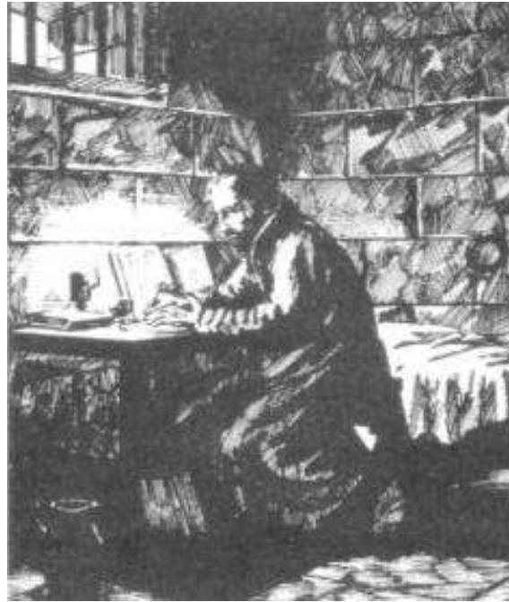
For 500 days Tyndale suffered in a cold, dark and damp dungeon in Vilvorde.

Bishop Stephen Bradley observed: “We are in danger of forgetting truths for which previous generations gave their lives.”