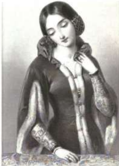
Anne became Queen of England.

Anne of Bohemia, was the eldest daughter of Emperor Charles IV of the Holy Roman Empire. Her brother was King Wenceslaus of Bohemia (who was named after the subject of a famous Christmas carol).