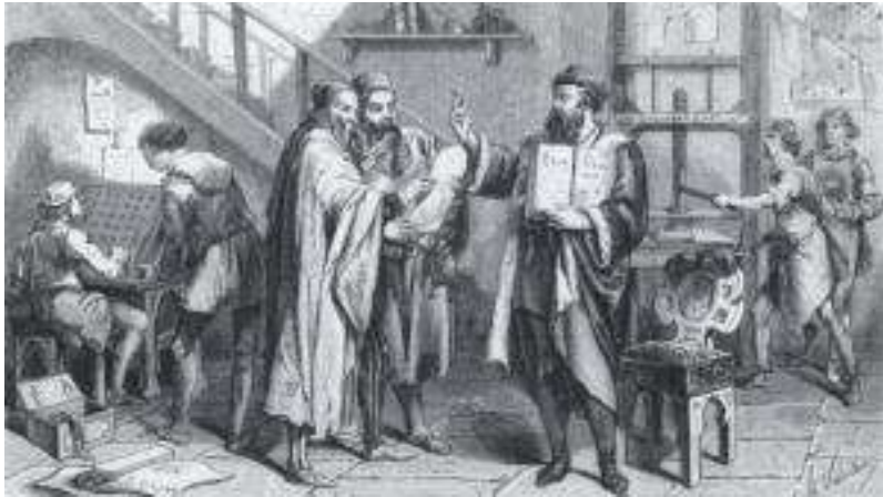
Johannes Gutenberg examines the first printed pages of the Bible.