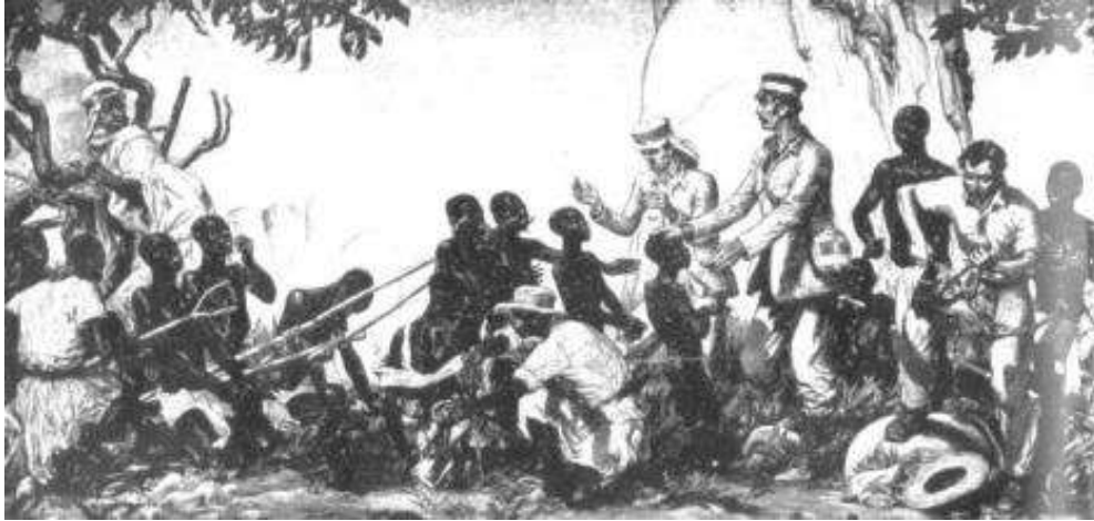
Livingstone the Liberator set many captives free from Arab slave traders. This incident was in the Shire valley.

David Livingstone was a great missionary pioneer pathfinder whose greatest desire was granted only after his death: the cessation of the slave trade and the opening up of Africa to Christianity and lawful commerce.