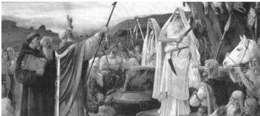
Boniface boldly confronted the Druids and proved that Christ was more powerful than the idols they feared.