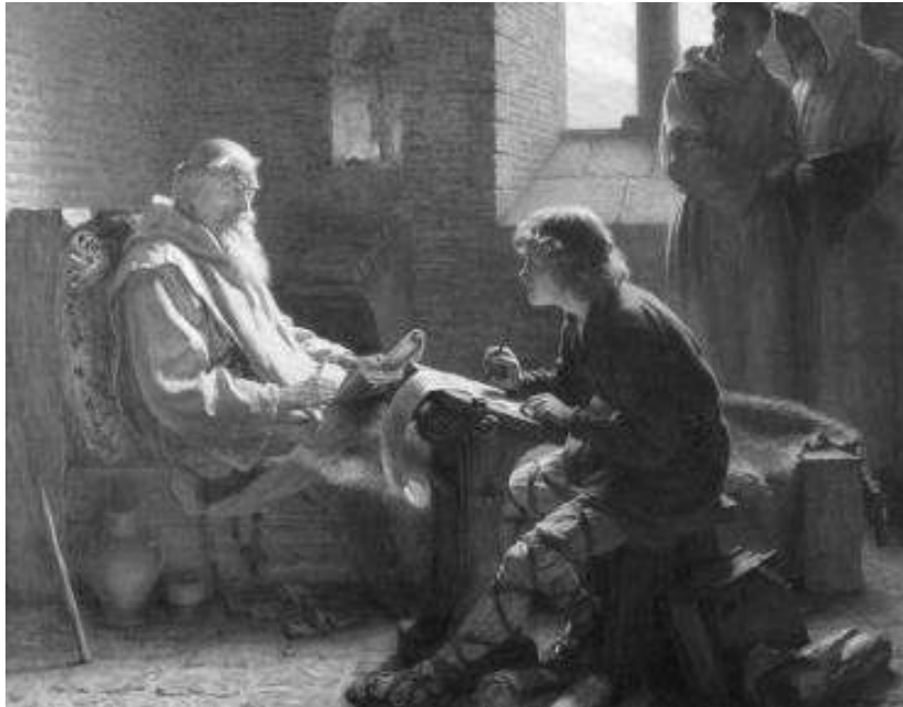
Bede dedicated his life to prayerful study and writing for the strengthening and edifying of the Church of Christ.

Bede was one of the most influential Bible teachers and historians, and it is from his practice of dating events from the incarnation of Christ – Anno Domini – that our present dating method of separating events before Christ (B.C.) and after Christ (A.D.) came into general use.