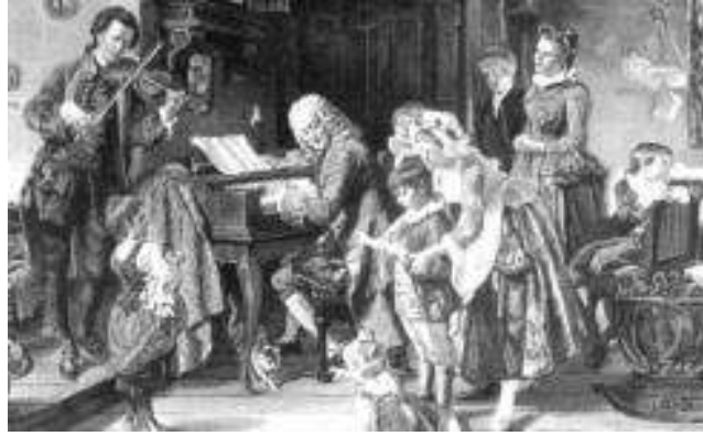
Johann Bach was a family man who delighted to sing with his children.