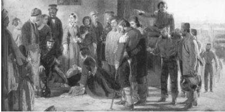
During the Crimean War, Florence Nightingale was commissioned by the British government to travel to Turkey and organise the care of British war wounded.

Few people realise the enormous debt which the whole world owes to Florence Nightingale. This courageous Reformer transformed hospitals and pioneered the modern nursing profession. No other person in history has done more to alleviate suffering and establish so high a standing of health care for the sick.