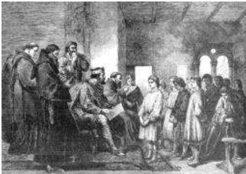
King Alfred pioneered education for all his subjects and sponsored many church schools throughout the kingdom.