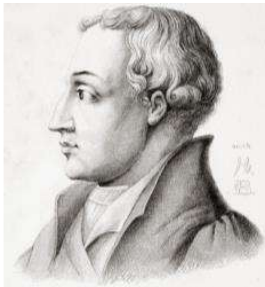
Martin Bucer, the Reformer of Strassburg and mentor of John Calvin.