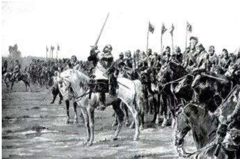
At the decisive Battle of Leipzig, the forces of Gustavus Adolphus destroyed the united armies of the Catholic League and the Holy Roman Empire.

Gustavus Adolphus is one of the most inspiring characters of the Reformation. The rapid rise to fame of Gustavus Adolphus, the young King of Sweden, his military innovations and dramatic victories in battle turned the tide in The Thirty Years War and saved Protestant Germany from annihilation.